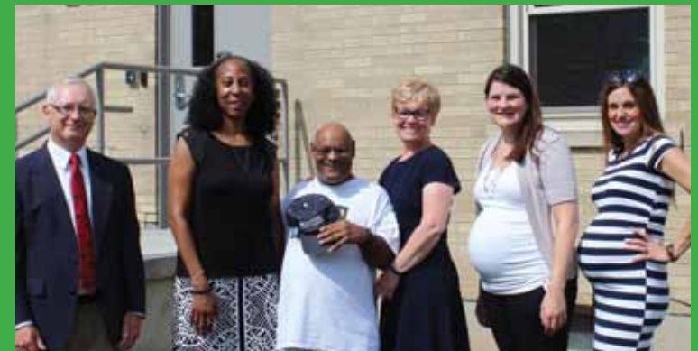
Executive Director, Cantalian Center for Learning